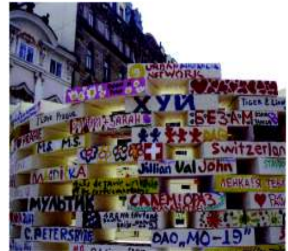
Urban Network: top brick, fundraising wall, Prague 2007

I was brought up in East Africa. I trained at the WA School of Nursing and went on to work in disability and rehabilitation. I had a motorbike accident on my way home from work and I sustained what is called contra coup damage to my brain. I have trouble with comprehension and it can be very frustrating. I keep note books and diaries to help.